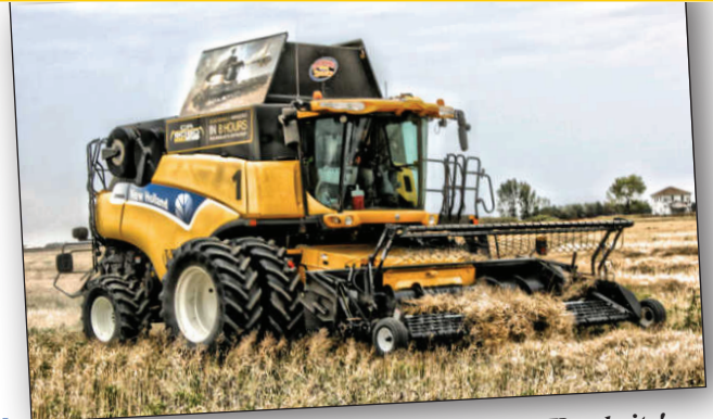
CR9090 photos taken at KF Kambeitz's farm, while harvesting canola.