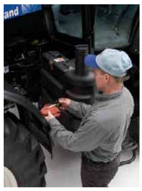
You can check the oil without raising the hood.

The side-mounted fuel tank has a capacity of 116 gallons for a full day's work in the field. Refueling is fast and convenient with a fill tube that can be reached easily from the ground. Another bonus – the fuel tank doesn't interfere with your visibility to front or back.