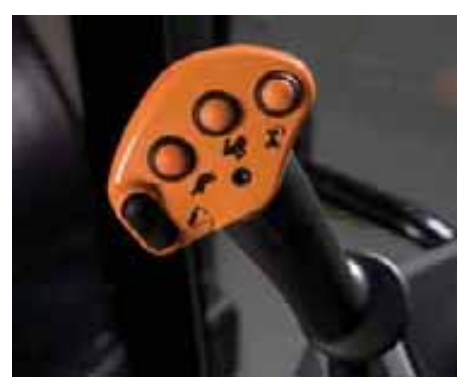
Complete transmission control is found on the convenient seat-mounted multi-controller.

The convenient power shuttle allows you to shuttle between forward and reverse without clutching, without stopping and without removing your hands from the steering wheel. Simply use your fingertips to flick the lever located on the left side of the steering column. Your right hand is always free for loader or implement operation. You can customize the shuttling action by programming the best reverse and forward gears for each job. For loader work, you can power into the pile and back out quickly, or program slower speeds when more precise movement is required.