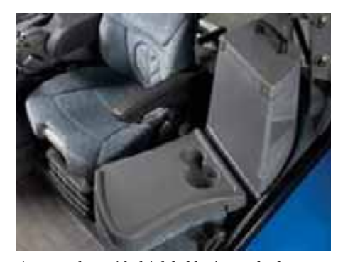
A storage box with drink holder is standard equipment on both standard and deluxe cabs.