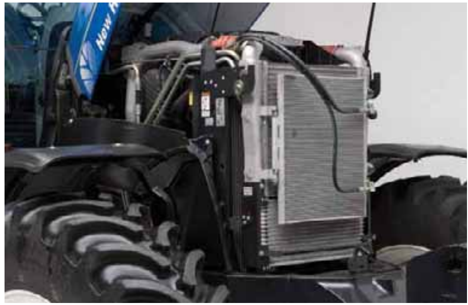
The common rail fuel injection system and electronic fuel management boosts fuel efficiency and engine performance.