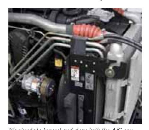
It's simple to inspect and clean both the A/C condenser and hydraulic oil cooler.