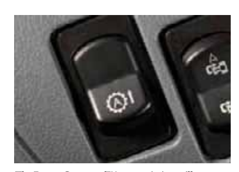
The Power Command™ transmission will automatically shift up or down within a span of gears based on engine RPM and applied flywheel torque. Just press the "Auto" button to engage automatic shifting in the field or on the road.