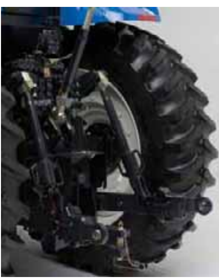
Standard Dynamic Ride Control<sup>TM</sup> helps prevent three-point-mounted implements from "bouncing" on the rear hitch during transport. You enjoy greater steering control, added safety and a smooth, comfortable ride.