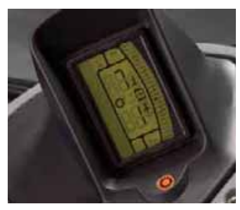
The Power Command digital display makes it easy to see your gear selection and functions such as auto-shift and custom Headland Management.