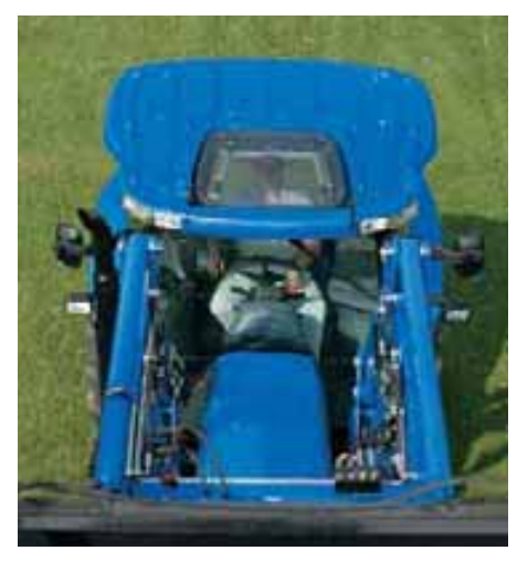
You now have a comfortable view of a raised loader bucket using the standard high-visibility roof panel.

to maintain the temperature you set. The Deluxe cab also features heated electronic external mirrors, a speaker upgrade and electrohydraulic rear remotes as standard equipment.