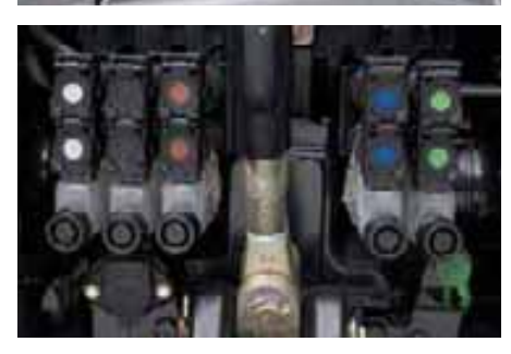
Hydraulic control levers and remote coupler dust covers are color-coded to assist with easy implement hook up and control.