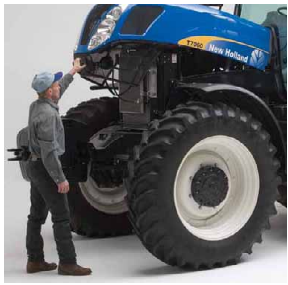
The T7000 features a flip up hood with gas strut, allowing for fast and easy access to the radiator, A/C condenser and engine air filter.