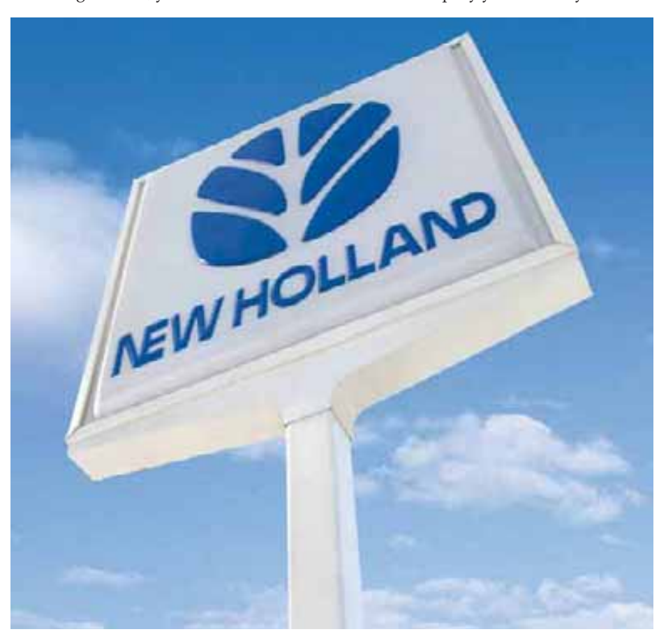
YOUR NEW HOLLAND DEALER

dealer can turn your financial challenges into opportunities. You name it — equipment, parts and service, financing, or just trusted, honest advice on farming and finance — you'll find it all at the blue and white sign. Around the world, or right down the road, we're the company you can always turn to.