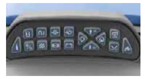
The enhanced instrument cluster with deluxe keypad allows you to program and view additional functions to keep you on top of all operations.