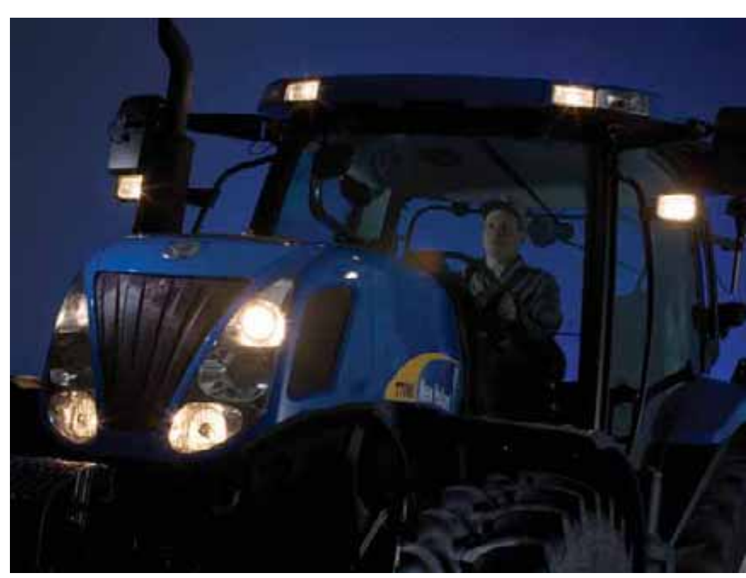
You have plenty of light to work efficiently at any hour with the T7000's best-in-class lighting package.

Working at night or in low-light conditions is not a problem with the T7000 Series tractor. You have a best-in-class lighting package with 12 halogen worklights at the ready. With eight forward-facing lights and four to the rear, you have all the illumination you need to get the job done.