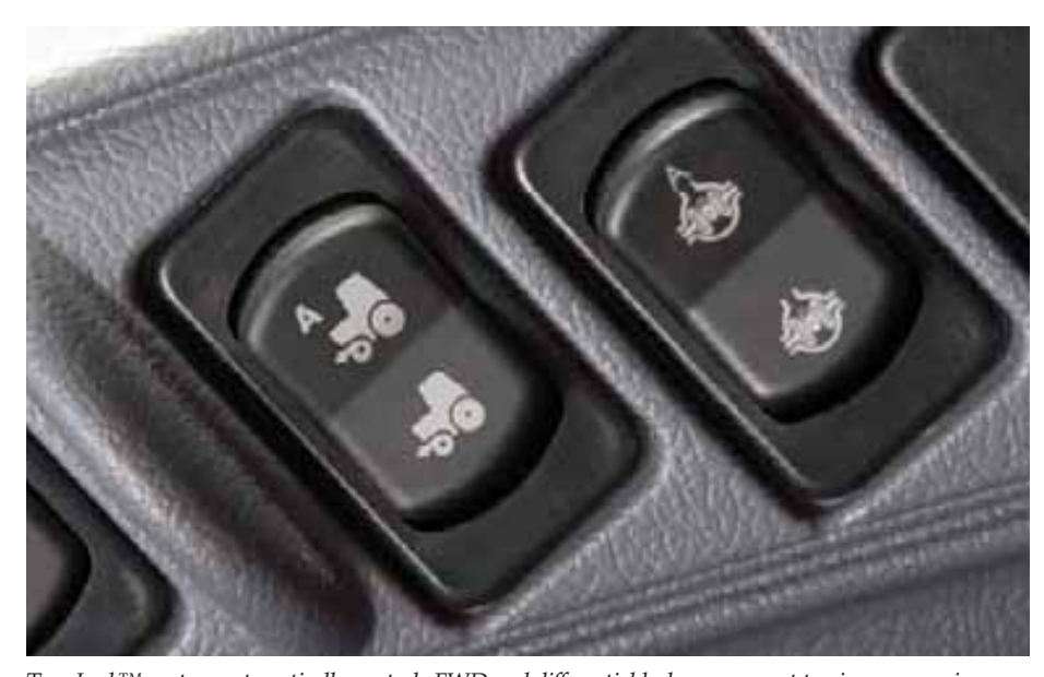
TerraLock^{TM} system automatically controls FWD and differential lock engagement to give you maximum traction and control.

Self-adjusting, self-equalizing hydraulic wet disc brakes deliver the stopping power you need. When both brake pedals are applied simultaneously, FWD engages automatically to aid in braking action for added control.