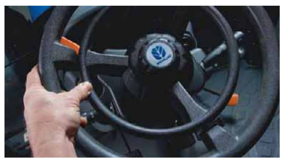
To engage FastSteer, simply press on the inner ring of the steering wheel. The FastSteer system automatically disengages when travel speed exceeds 6.2 mph.

for use. Then, when you're ready to make your turn, simply press the inner ring of the steering wheel to engage FastSteer. A light on the instrument panel indicates the system is engaged. When you release the inner ring of the steering wheel, normal steering returns instantly. For safety, the FastSteer system will only engage at speeds below 6.2 mph.