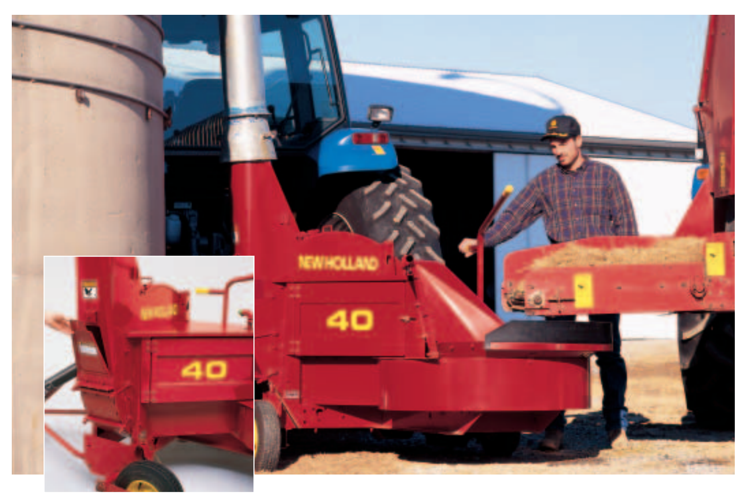
A convenient access door makes it easy to check fan-blade-to-band clearance and to replace fan paddles.