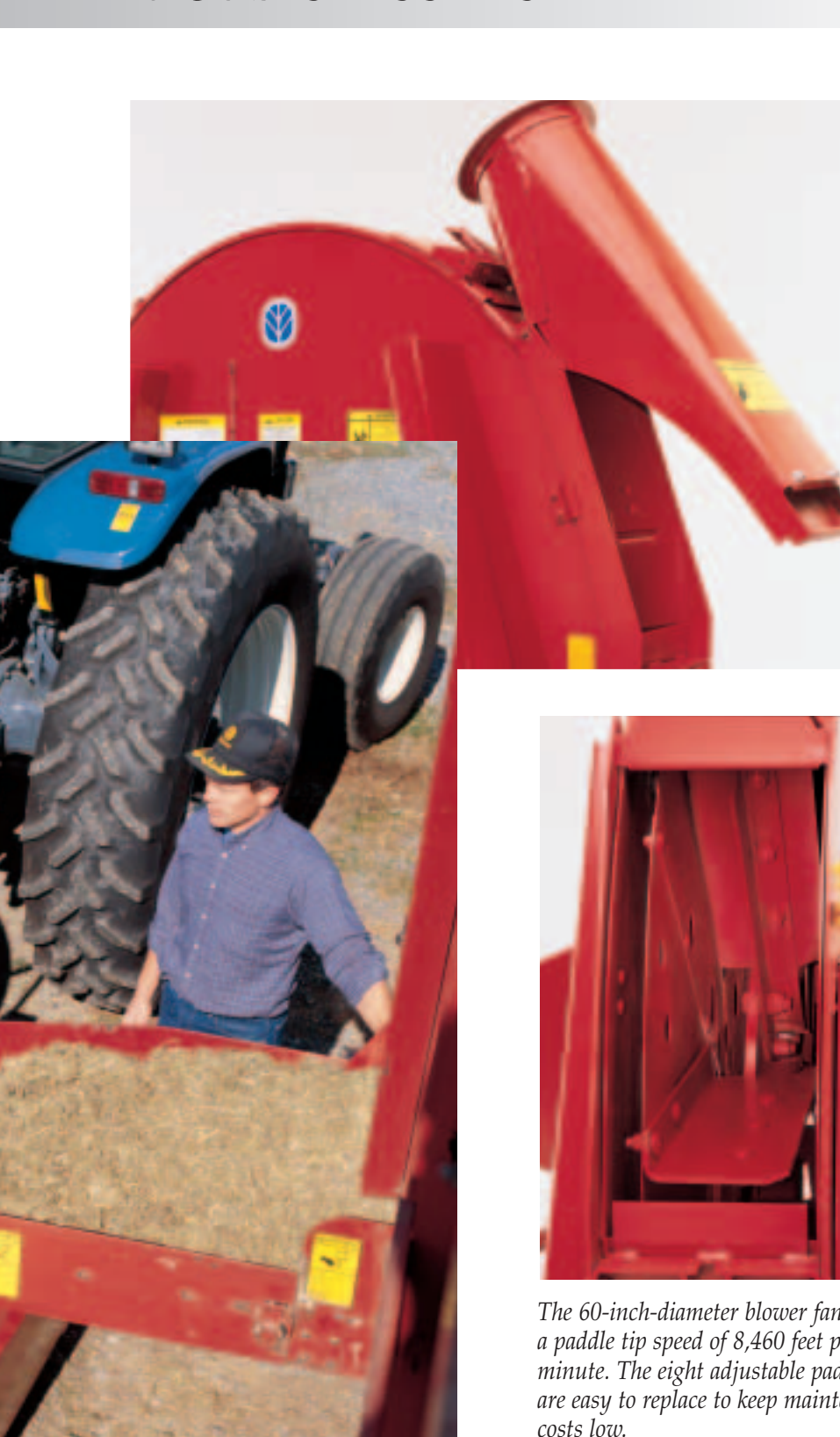
The "F62B" has a hinged blower outlet assembly so it's easy to inspect and maintain the fan paddles.