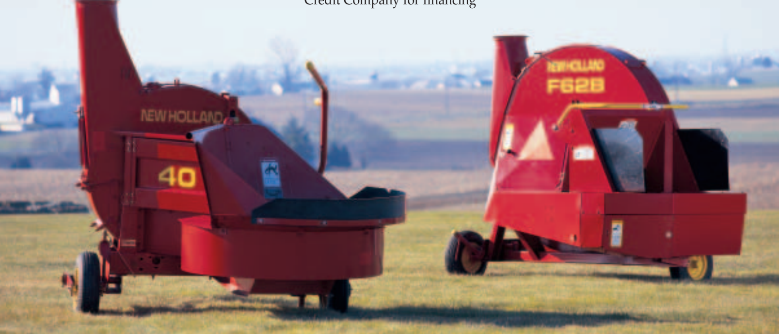
YOUR NEW HOLLAND DEALER

Trust New Holland—and your New Holland dealer—for quality, reliability and value.