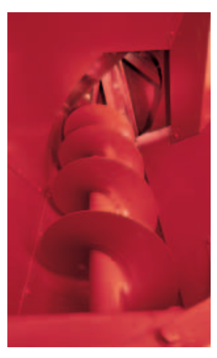
The new Model F62B forage blower has a direct-feeding auger positioned at a 30-degree angle to quickly move material into the high-capacity hopper.