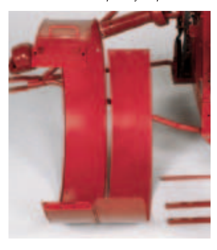
Replaceable fan wrapper liners are made of abrasive-resistant steel to increase blower life.

New Holland Whirl-A-Feed® forage blowers have been filling silos for more than 30 years. The combination of high capacity and high efficiency makes the Model 40 an outstanding value.