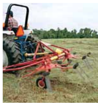
The mounted Model 157 tedder fluffs a 8'6" swath and maneuvers easily around smaller fields. The lefthand rotor tine bar flips up for narrow 8' transport.

Air flows through it, not just over it, so you can bale sooner—before it rains. And if showers hit unexpectedly, you can easily spread damp, matted-down crop for quick drying.