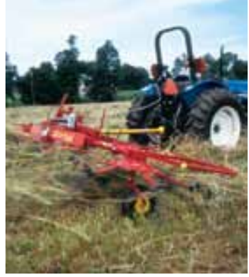
The Model 163 tedder features four rotors to cover an expanded 16'5" width, yet folds to a width of 9'6" to maneuver easily through gates or narrow roadways.