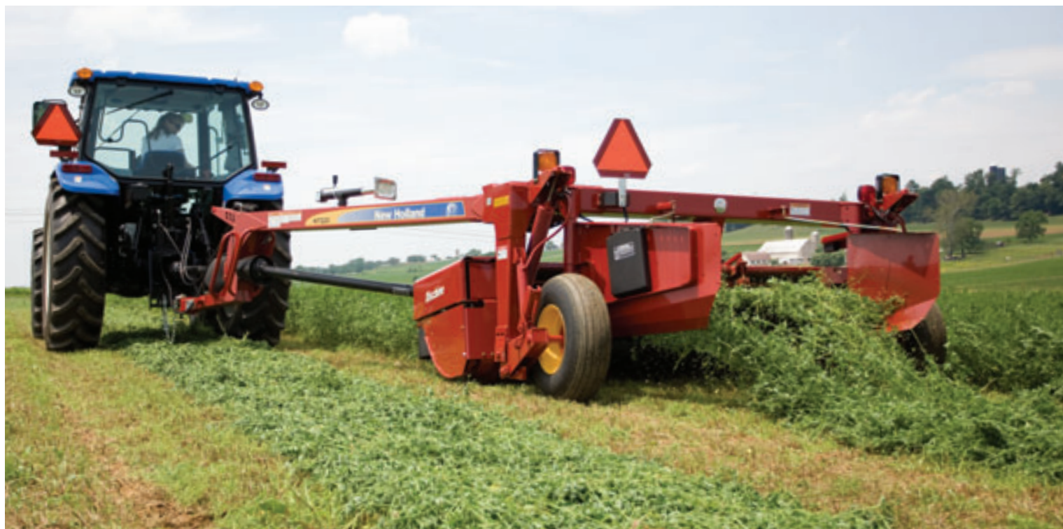
Adjustable header flotation springs and on-the-go cutting height adjustment allow you to get all the crop without scalping or knife damage.