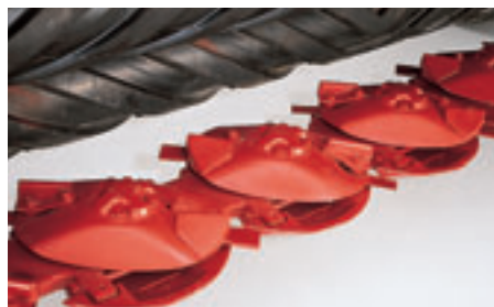
Two heavy-duty knives on each disc spin at 3,000 rpm for fast cutting without plugging.

New Holland's MowMax cutterbar sets the standard for the industry. It's the secret to smooth, quiet, trouble-free mowing—and fast, inexpensive cutterbar servicing. Each disc is driven through an individually sealed gearbox with a dedicated oil reservoir. There's never an oil starvation issue, even with continuous cutting on an incline.