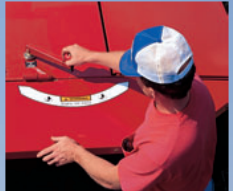
A simple turn of a hand crank lets you raise the conditioning hood away from the flails for lighter conditioning. Lower the hood for more aggressive action in grass. (Model H7330 shown)

All Discbine® models feature fast and easy windrow shield adjustment, all without tools. Depending on crop and moisture conditions and your method of final harvesting, you can spread the cut crop in a fast-drying swath as wide as eight feet (depending on model) or down to a tight, three-foot windrow that's ready to bale or chop.