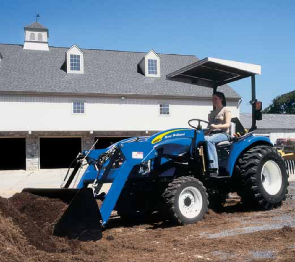
The 200TL Series loaders provide unmatched visibility to the bucket.