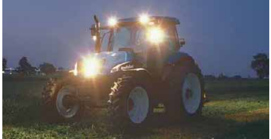
Night work is a pleasure with the best halogen lighting package on the market.

The Horizon cab is outfitted with all the comforts of home. A deluxe, air-suspension seat adjusts in a multitude of ways to assure your absolute comfort. Features include built-in lumbar support, tilting back rest, tilting seat, seat length adjustment, swivel, adjustable armrests and adjustable