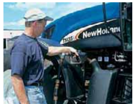
Fueling up from ground level saves time and effort. A 67-gallon tank is standard on the largest three models with a 46-gallon tank on the TS100A.