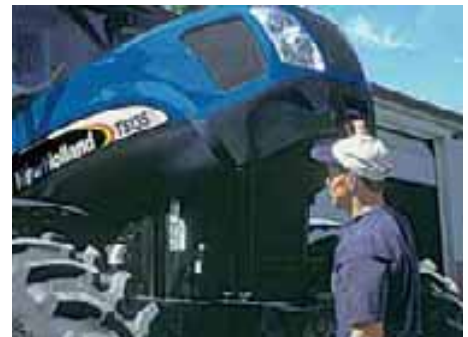
The convenient, one-piece hood opens effortlessly on gas struts to provide access for routine maintenance. The oil cooler and A/C condenser slide out to the side for easy cleaning.