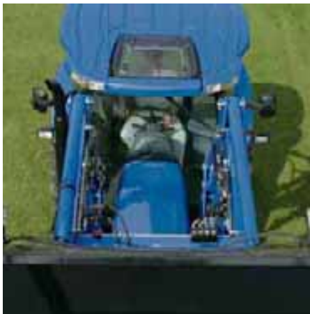
This unique high-visibility panel on the cab roof gives you outstanding visibility to the loader bucket and can be opened for natural circulation.

The sweeping views you enjoy from the seat of a TS-A Series tractor make it easier to stay fresh all day long. Visibility is outstanding thanks to an expansive windshield and two wide, full-glass doors. And, a unique overhead visibility panel with built-in sunshade affords you a view above — great for seeing the bucket during loader work. Front and rear windshield wiper/washers are standard equipment.