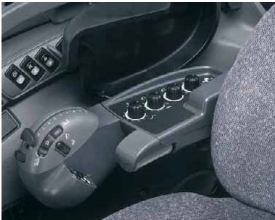
Deluxe cab models include controls for electronic draft control located conveniently on the right-hand armrest console, with additional hydraulic controls under the armrest.

A Category II/IIIN three-point hitch with electronic draft control is standard on the TS135A, and all Deluxe cab models. This electronically controlled hydraulic system senses changes in the draft load with sensors in the lower link pins.