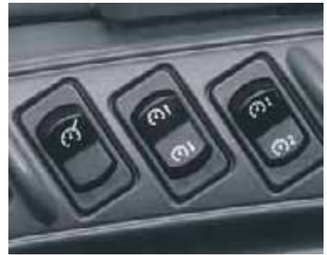
The Constant Engine Speed feature on the TS125A and TS135A allows you to pre-set two engine speeds. Use one for a constant working RPM, then toggle to the lower RPM to turn at the end of the row.