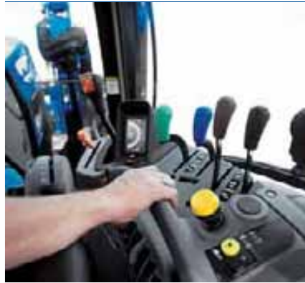
A rear 540/1000 RPM PTO is standard equipment. It has a single reversible shaft and includes soft start and coast down features.

Another plus of electronic power management (TS125A and TS135A) is the Constant RPM feature. You can pre-set up to two fixed engine speeds that match your needs, then use a convenient toggle switch to change from one speed to the other. This feature allows you to keep your eyes on the job, not on the throttle lever or RPM display.