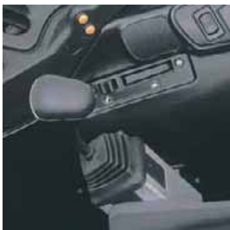
Controls for the three-point hitch and draft control are conveniently positioned for fingertip control. The loader control joystick, mounted on the seat, is designed to move with you for added comfort.

include an engine tachometer, engine coolant temperature gauge and a fuel gauge. Three liquid crystal displays (LCD) report ground speed, the time, PTO speed and three-point hitch position. In addition, a series of 21 colored lights surround the gauges to provide additional operating information and warnings.