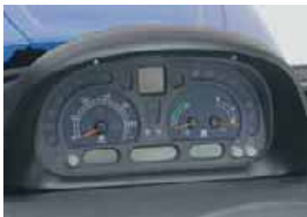
Analog and digital instrumentation includes an hour meter, engine temperature, tachometer and fuel gauge. LCD displays report ground speed, time, PTO speed, three-point position. A series of 21 indicators and warning lights keep you informed.