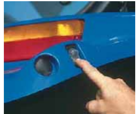
Rocker switches on the rear fenders (deluxe cab tractors only) allow you to raise and lower the three-point hitch for easy implement attachment.

equipment on electronic draft control hitches, and takes the bounce out of three-point mounted implements during transport.