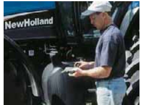
You can easily check and fill engine oil without raising the hood.