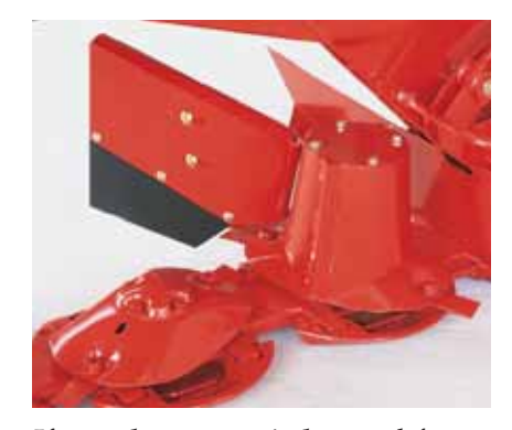
If you choose to windrow, a lefthand drum and swathboard are available.