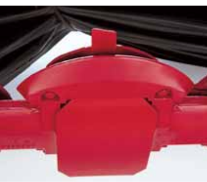
Skid shoes are 1/4" thick and 8" wide to protect the disc modules from obstacles. They extend behind the module several inches for optimum flotation and extended wear life of the shoe. Their unique shape works with cutterbar tilt to provide a broad range of cutting heights.

Rock guards are made of thicker, heattreated ductile iron for longer wear compared to competitive rock guards which are stamped out of sheet metal. Rock guard and skid shoe replacement is as easy as it gets — just remove two bolts to replace.