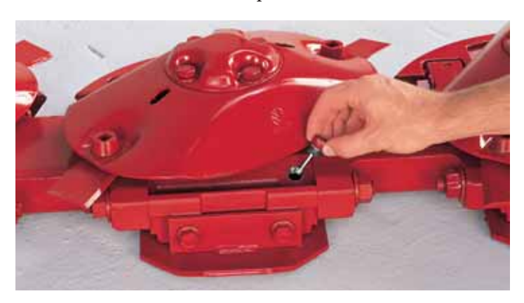
Cutter bar service couldn't get much easier. Check the oil in the modules every 50 hours with the convenient dipstick provided in the cap. Change the oil once a seasen or every 200 hours. For even more convenience, only one type of oil (80W90,GL5) is needed for all locations.

When it comes to servicing, the easier the better. No one else makes it this simple.