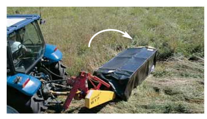
A spring-loaded breakaway latch protects the cutterbar by allowing it to swing back the instant an object blocks the cutter path. Simply back up to re-engage the latch.