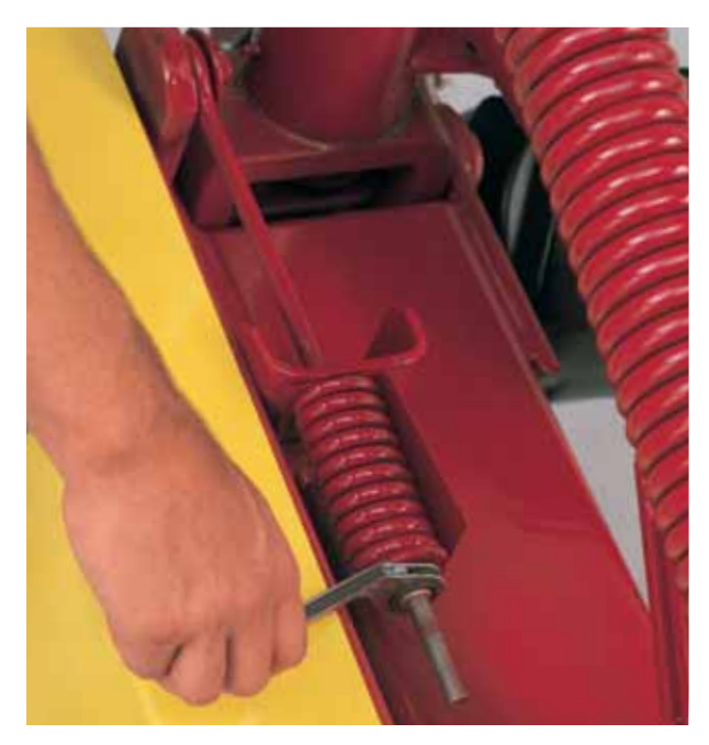
Exclusive V-belt tension spring has an easy-to-see tension indicator so you can check belt tension at a glance. Adjusting tension is easy, too — there are no shields to remove. All it takes is the turn of a nut.