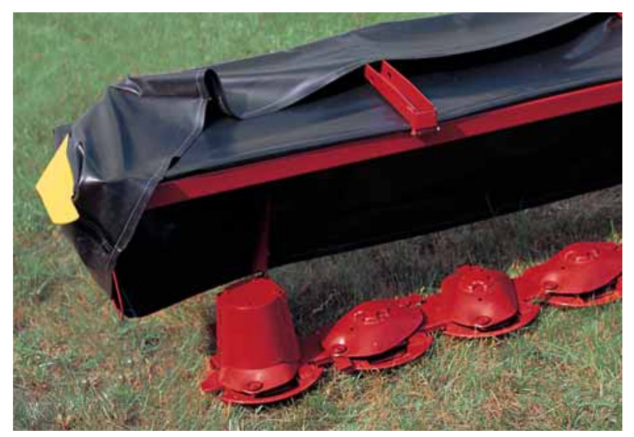
Plugging is a thing of the past because there's no connection between the right end of the cutterbar and the canopy support.