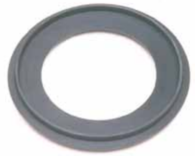
Unique "T-seal" washer is positioned between each pivot arm and bevel gearbox to prevent sand and dirt from entering and damaging the pivot bushings. An additional lip seal is positioned toward the outside of the pivot arms to protect against damage from debris.