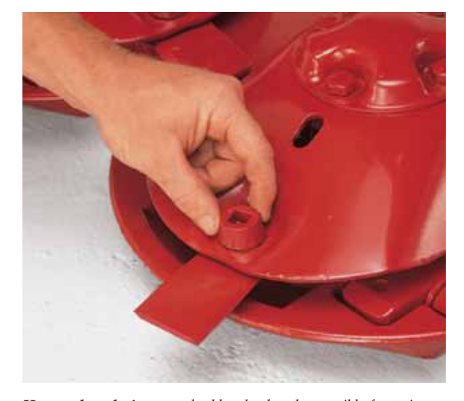
Heavy-duty knives are double-edged and reversible for twice the mowing life. Changing them is a snap — you don't have to bother raising the cutterbar like some competitors. Bolts are located on top for easy removal with the disc in any position.