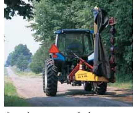
Cutterbar transport lock engages automatically for a secure hold. Just pull the cord to release.