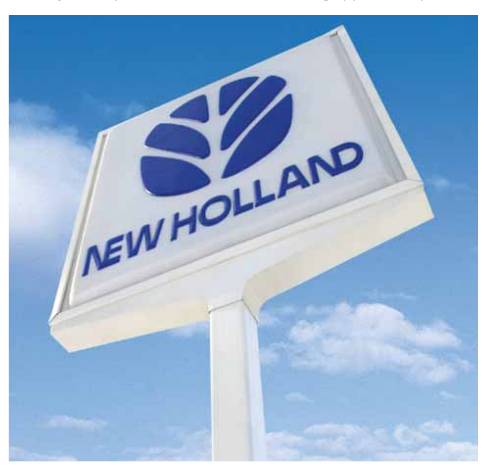
YOUR NEW HOLLAND DEALER

dealer can turn your financial challenges into opportunities. You name it — equipment, parts and service, financing, or just trusted, honest advice on farming and finance — you'll find it all at the blue and white sign. Around the world, or right down the road, we're the company you can always turn to.