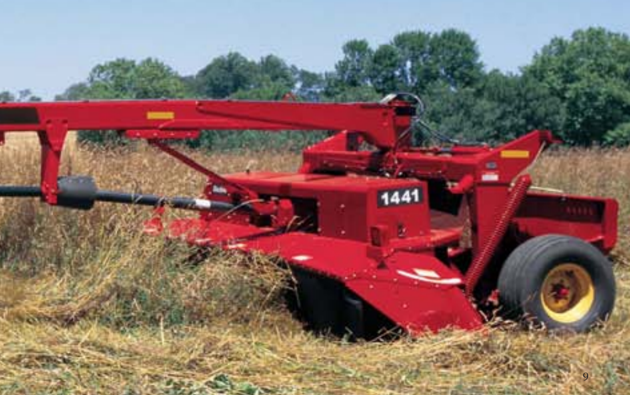
A center-pivot, swivel-hitch tongue provides even better maneuverability and tight corner cutting than a standard drawbar center-pivot.

tongue design you can enjoy swivel hitch-like convenience and performance without the need for a three-point hitch or drawbar extension. You can mow at most any angle and make square and over-square corners without vibration or noise.