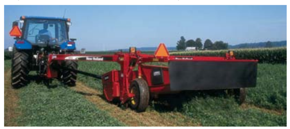
Adjustable header flotation springs and on-the-go cutting angle adjustment allow you to get all the crop without scalping or knife damage.

• For optimum flotation and protection, skid shoes are 8-inches wide and extend behind the module a full two inches.