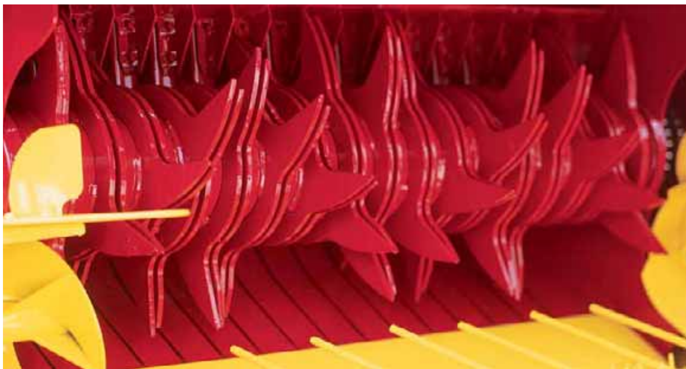
CropCutter, with all 15 knives installed, produces a cut crop length of 2.6 inches. CropCutter puts more crop in every bale and enhances fermentation in silage bales.