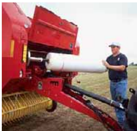
Rolls of net for the EdgeWrap™ wrapping option load easily into the front of the baler.

Units equipped with EdgeWrap come with Bale Command Plus™ as standard equipment. That puts you in complete control of all wrapping functions right from the comfort of your tractor seat.