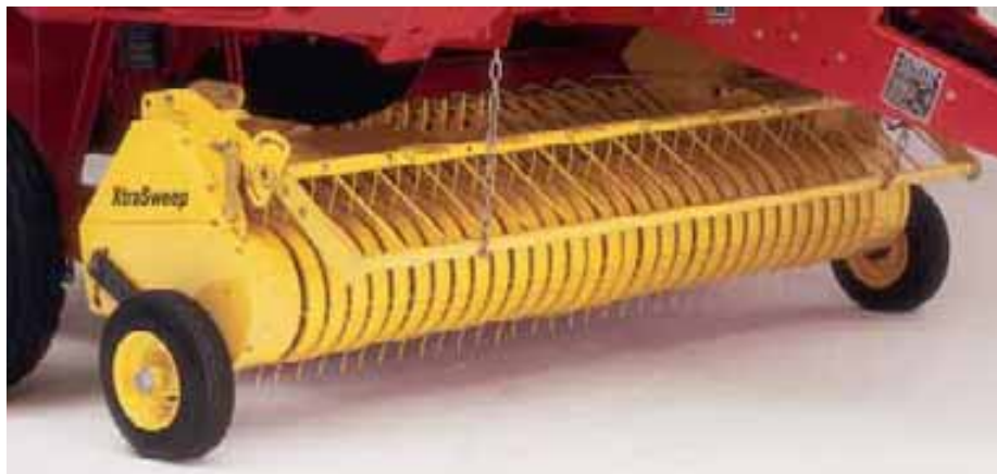
Both XtraSweep™ pickups use the same full-width, dual-pivoting windguard for total crop control into the bale chamber and two flotation gauge wheels to follow contours in the field