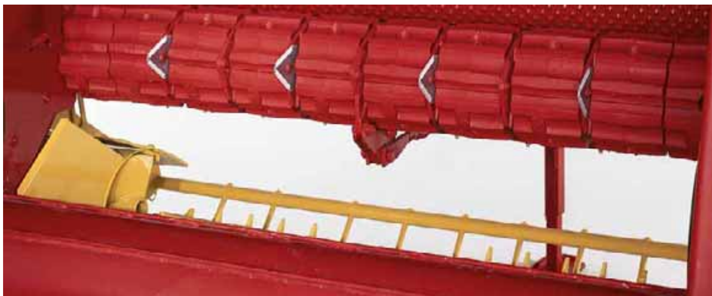
Bale-Slice™ features a series of knives on the starter roll that pivots into the rotating bale after the core is formed. Select from one, three, four or seven knives depending on crop conditions.

roll. These knives pivot into the bale after the core is formed, resulting in bales that peel apart for easier feeding. Knives are reversible for increased life. When replacement is necessary, knives are inexpensive and easy to replace.