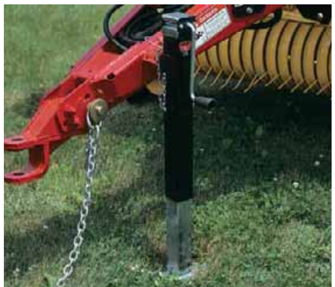
A heavy-duty hitch jack provides easy tractor hookup with jacking heights of up to 22 inches. Once the baler is hitched to the tractor, the jack is easily relocated up and out of the way to avoid interference with the tractor's 3-point hitch arms, tractor tires and crop windrows.