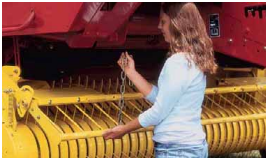
Adjustable windguards help control flow of crop from the pickup into the bale chamber.

This low-profile pickup allows you to pick up extra-wide or windblown windrows. Its floating windguard improves crop control. Stronger cam follower bearings and a pickup lift crank extend the pickup's operational life. An anti-wrap shield in the right hand reel bearing prevents damage from crops. Silage Special balers are equipped with dual cam pickups to handle tough silage conditions.