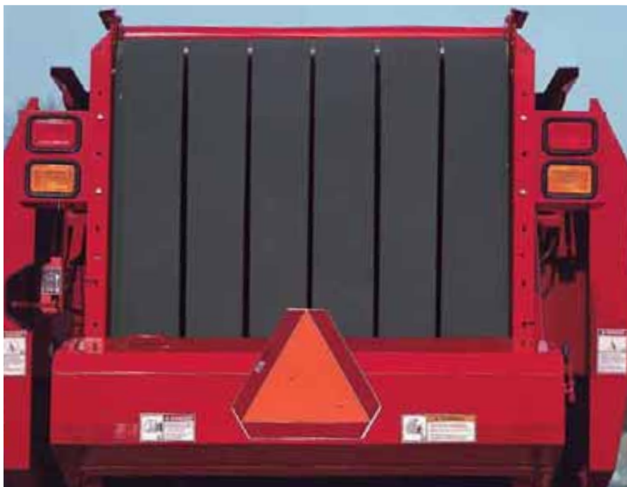
Endless belts offer longer life and less maintenance than laced belts.