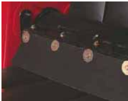
Three rolls have scrapers to remove crop that can build up on the rolls.

• Endless belts that offer superior life and performance over laced belts. Endless belts eliminate the splice and the associated fastener maintenance. And, New Holland endless belts are backed by an exclusive Bonded Protection Plan. If these belts fail due to defects in material or workmanship within the first three years or 15,000 bales, New Holland will replace them free.