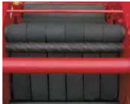
A rubber back wrap roll eliminates crop build-up on the back of the belts.