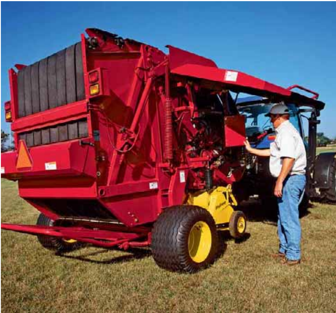
Gull-wing doors on both sides of the baler make daily maintenance a simple process.