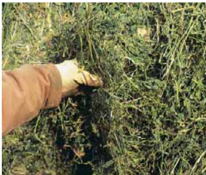
The CropCutter™ system produces ultra-dense bales and outstanding feed quality.