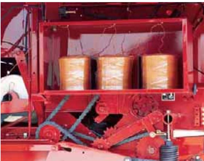
Side-load twine storage boxes hold six balls of twine on the BR740A, BR750A, BR770A and BR780A Auto-Wrap™ balers. An additional five or six balls of twine, (depending on the model), can be stored in an optional front storage box on Auto-Wrap balers. All twine-net balers hold six balls of twine and two rolls of net.