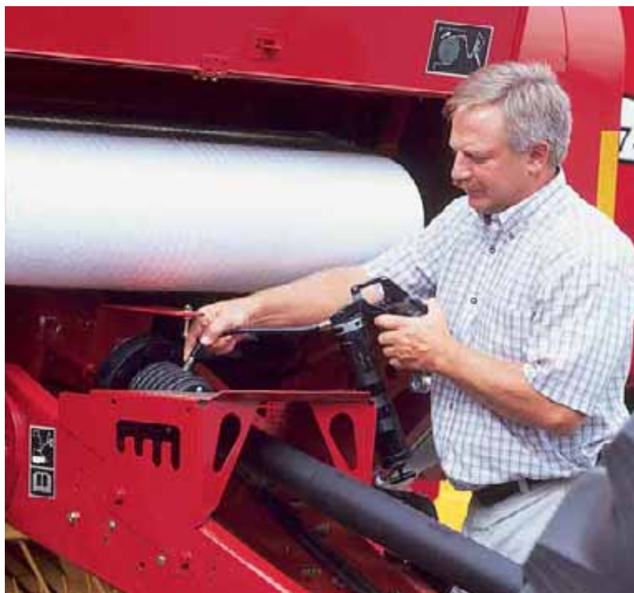
The front of Bale Command Plus balers is wide open for fast and easy maintenance.