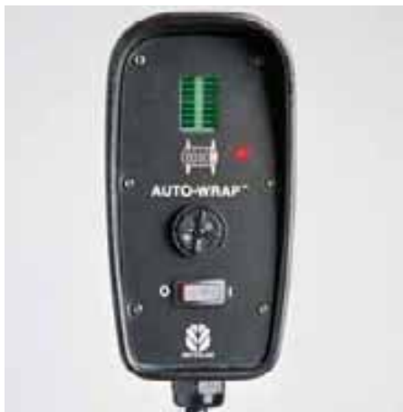
A bale shape monitor mounts inside the tractor cab. It helps operators make dense, uniform bales by showing which side of the baler needs more crop. A bale size indicator located on the right/front of Auto-Wrap balers monitors bale diameter.

Auto-Wrap ensures consistent twine placement, which means your last bale will look every bit as good as your first. Twine tensioners mounted on the twine tube ends keep the twine tight. You get reliable twine starts in all crops and conditions.