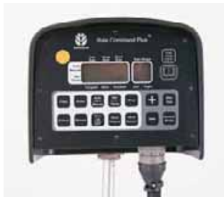
With Bale Command Plus™, all baler functions plus tying or wrapping are closely monitored right from your tractor seat.

or CropCutter™ knife engagement and tailgate switch to indicate whether or not the tailgate is closed and latched.