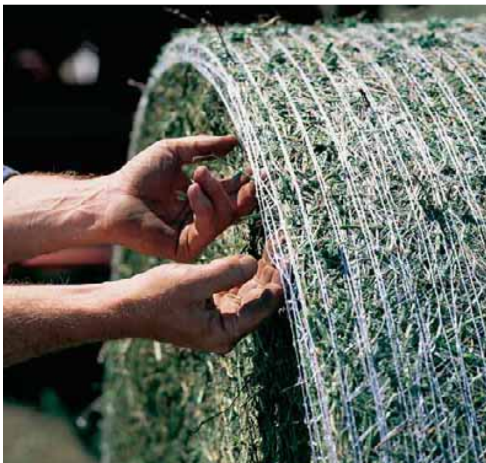
"Over-the-edge" wrapping produces bales that hold their shape and are easier to handle, transport and feed.