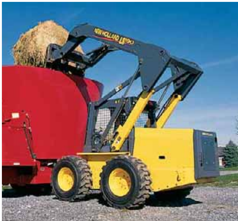
CropCutter™ bales grind more easily in a TMR mixer wagon.

CropCutter bales are more dense and heavier due to the smaller particle length. In silage, this increased compaction means less air in the bale, resulting in better fermentation. In straw, it results in easier spreading and increased absorbency. No matter what the crop, bales made with CropCutter put more crop in every bale—translating to fewer bales per field, fewer bales to transport and store. That's productivity.