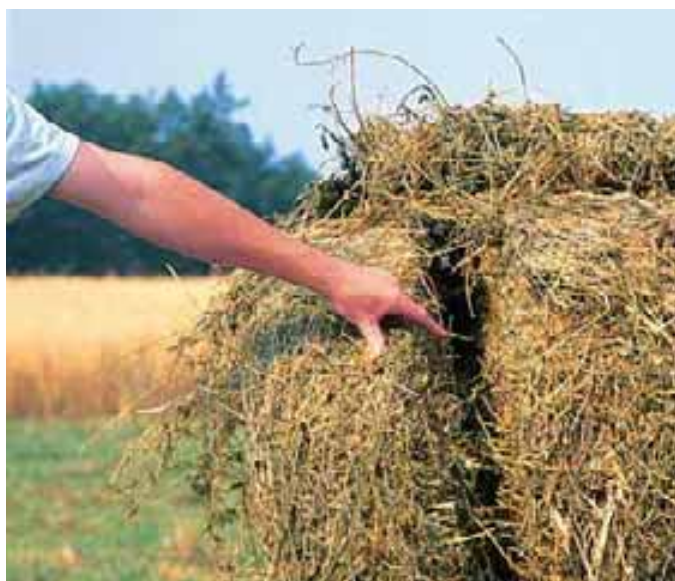
Bales made with Bale-Slice pull apart easily, making them easy to feed, easy to digest.