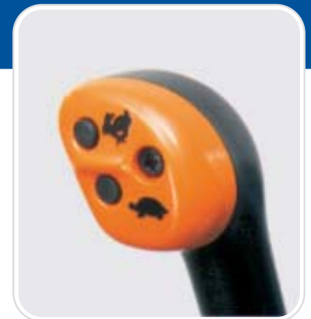
Four-speed hydrostatic transmission with Dual Power™

The comfortable Boomer™ seat, open platform and convenient controls make your job more pleasant than ever.