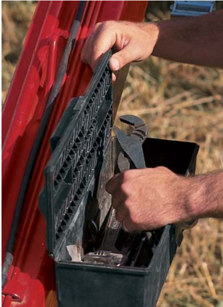
A standard toolbox gives you convenient storage space for tools or spare parts.