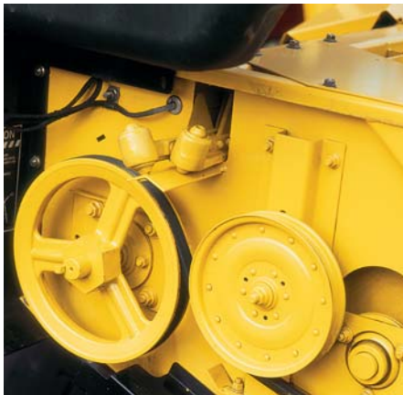
A storage location for two complete knife assemblies is provided in the header frame.