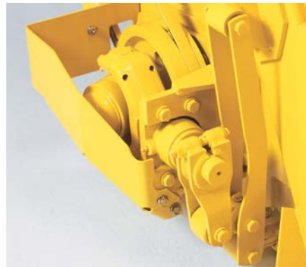
Heavy-duty, timed wobble drive provides reliable trouble-free operation.

The 1475 handles your crop gently, resists plugging, and provides even, thorough conditioning that helps you get the crop out of the field sooner. Proven New Holland 102-inch chevron-design, intermeshing rubber rolls condition crop thoroughly for fast drydown