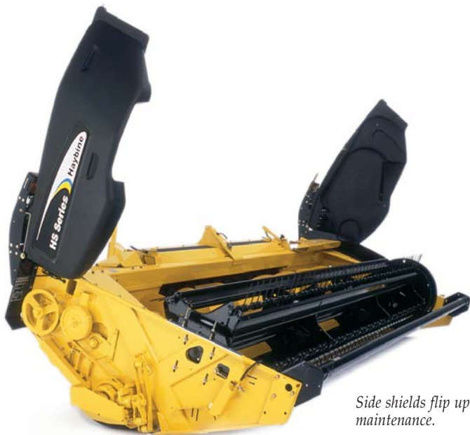
Side shields flip up and lock in place for easy maintenance.