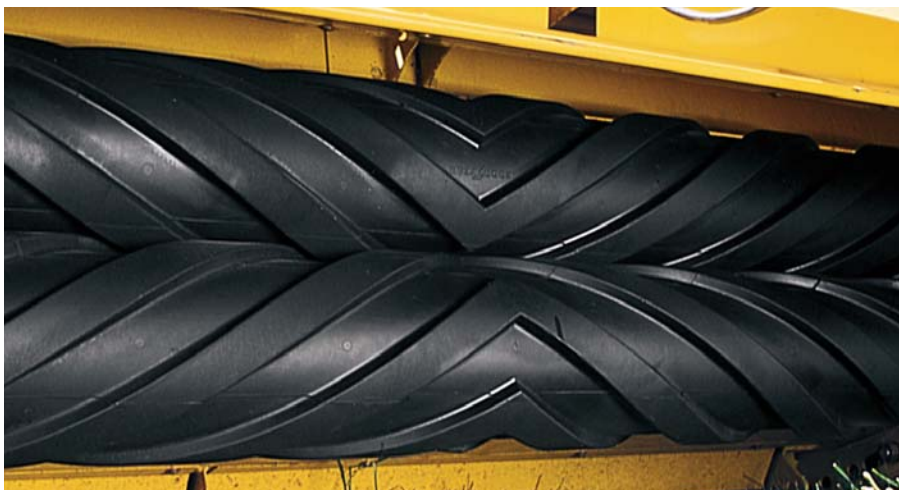
Wide, 102-inch New Holland chevron-design intermeshing rubber rolls condition your crop gently and thoroughly.

You have infinite control of roll pressure so you get the exact amount of conditioning needed for your crops and conditions. Roll pressure adjusts with the simple turn of a crank—no tools needed. Also important for optimum conditioning is the proper roll gap setting, which controls conditioning intensity and the resulting drydown performance. An easy-to-use roll gap adjustment tool is provided.